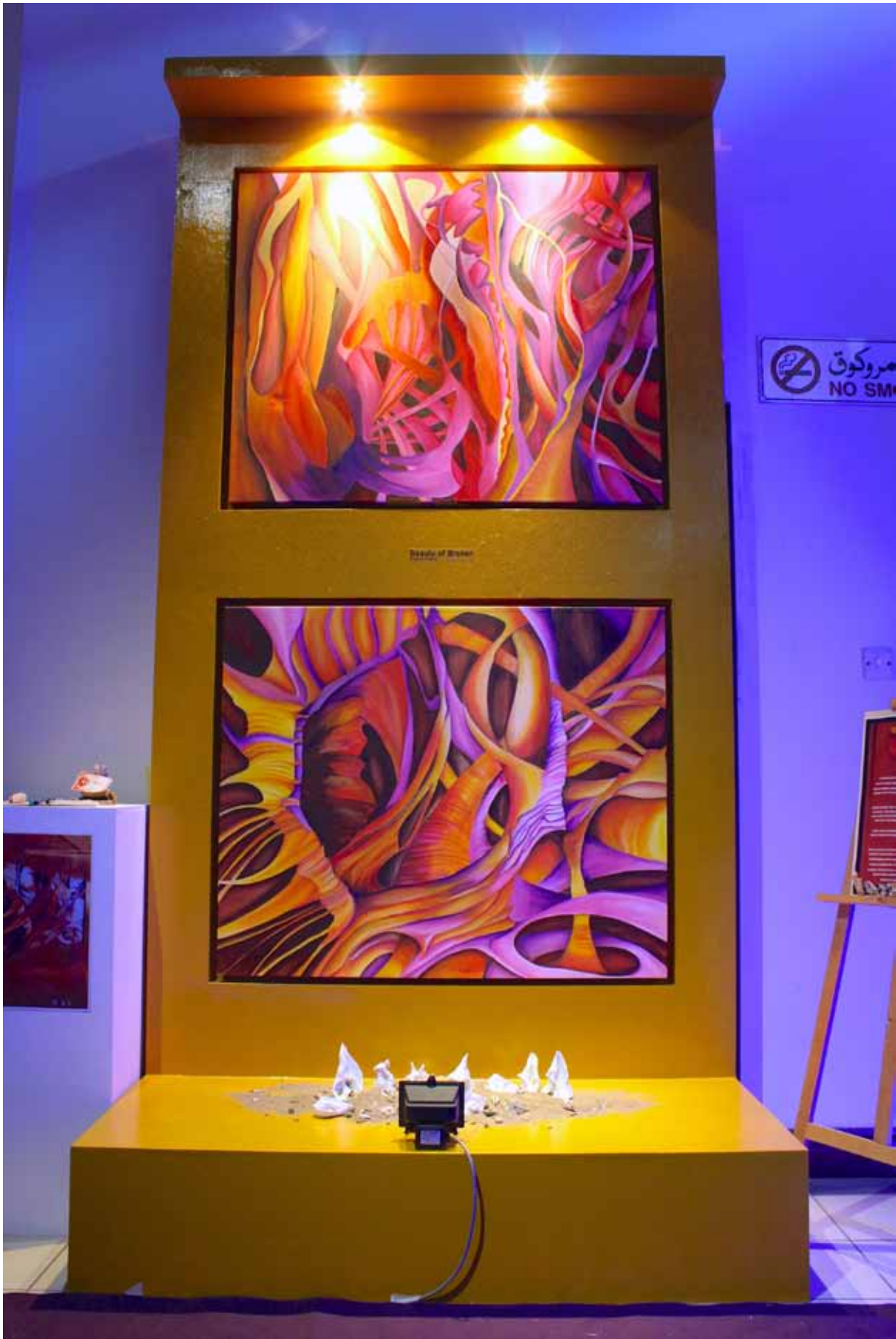
Image 4: Norafizah binti Awang. The Beauty of Broken . 2015. Acrylic on canvas with clay sculpture, each: 30"H x 40"W.