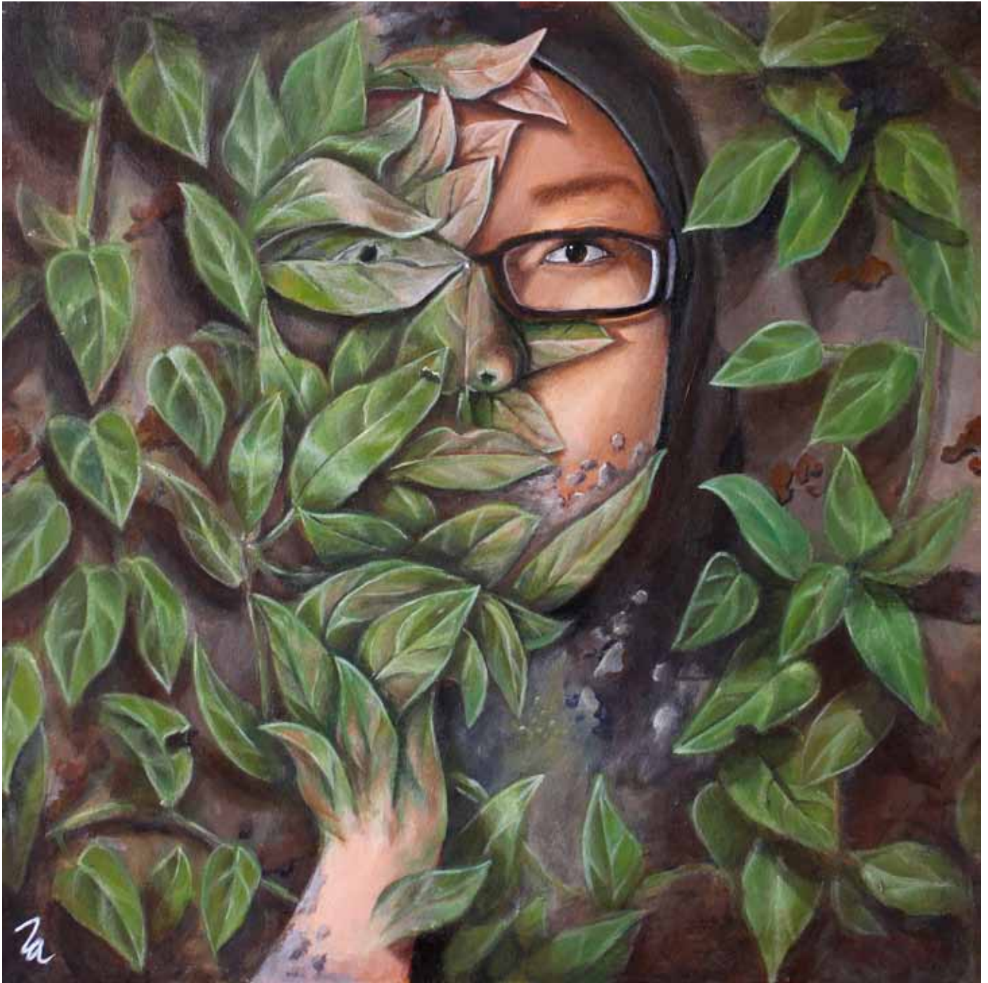
Image 10: Zubaidah Ahmadin Synthesis Painting . 2013. Acrylic on canvas, 16"H x 16"W.