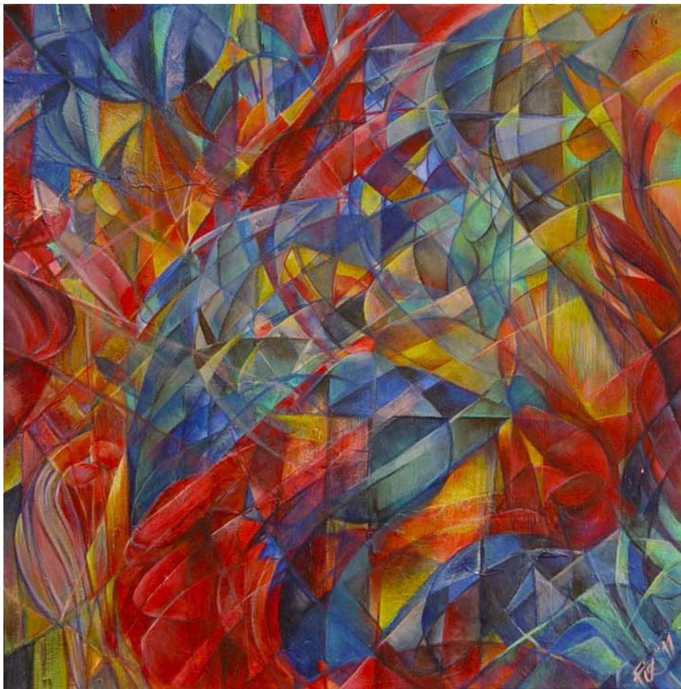
Image 13: Affizah Rahman. Abstract Painting . 2013. Acrylic on canvas, 16"H x 16"W.