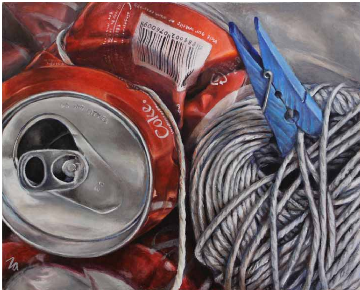
Image 17: Zubaidah Ahmadin. Given Object Painting . 2013. Acrylic on canvas, 16"H x 20"W.