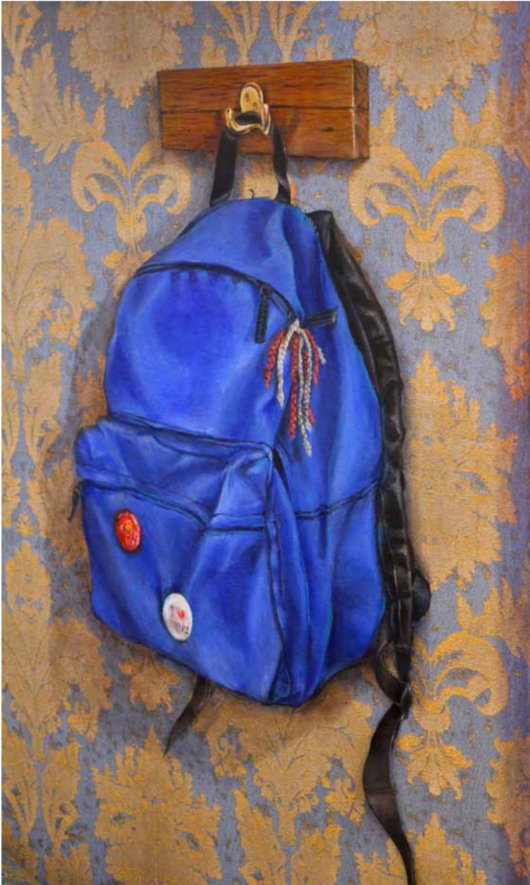
Image 15: Zubaidah Ahmadin. Deception of the Eyes . 2013. Acrylic on canvas, 60"H x 30"W.