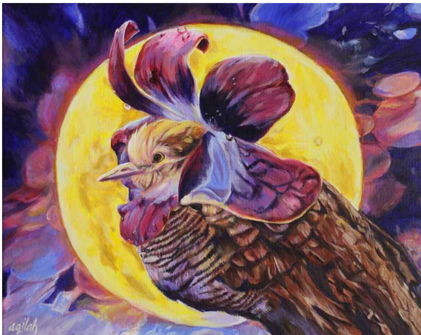
Image 12: Aqilah Hj Morshidi. Synthesis Painting . 2014. Acrylic on canvas, 16"H x 20"W.