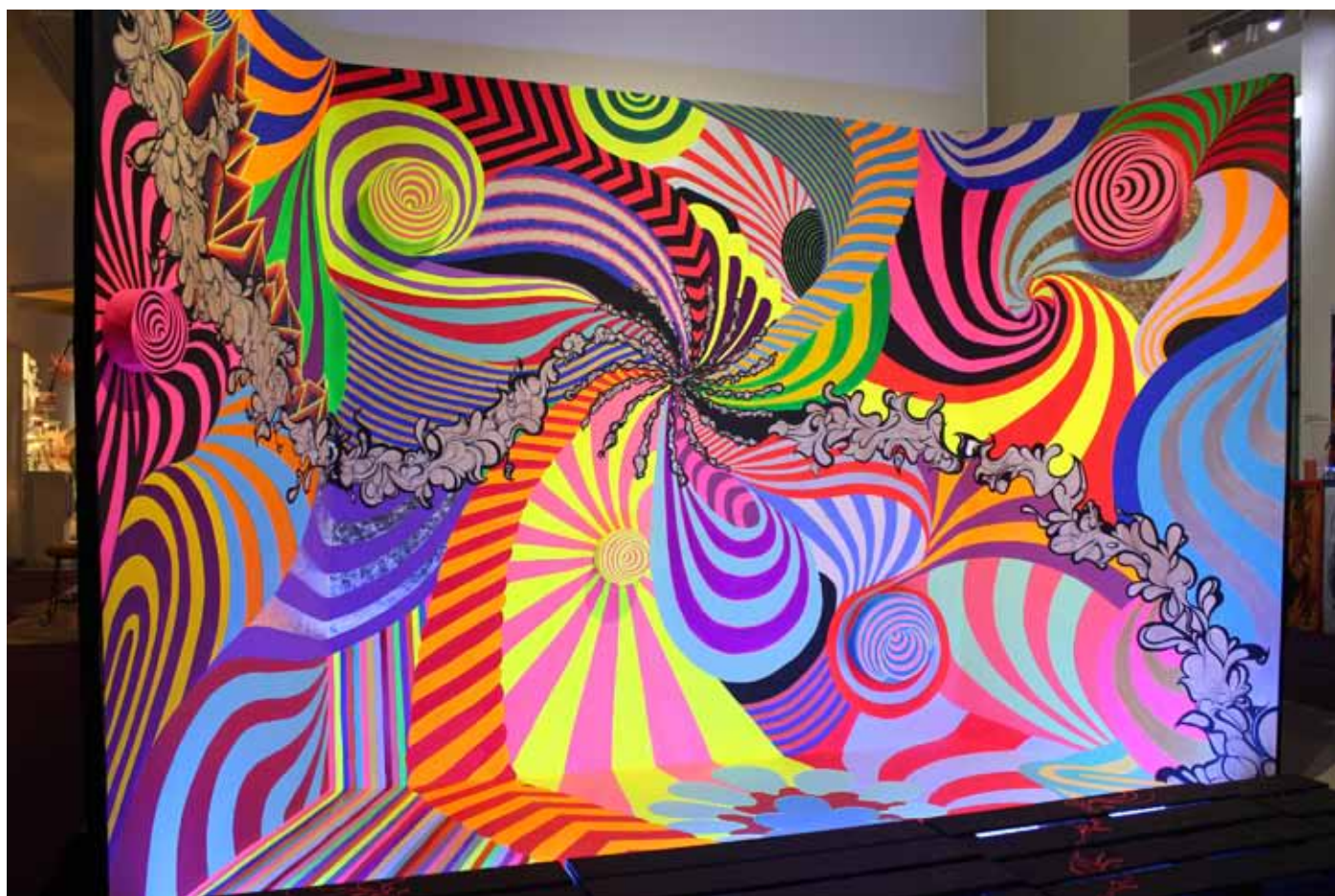
Image 20: Nurul Suzanina bte Zainal Arshad. Imaginarium . 2015. Acrylic & mixed media on wood panel, 96"H x 120"W x 48"D.