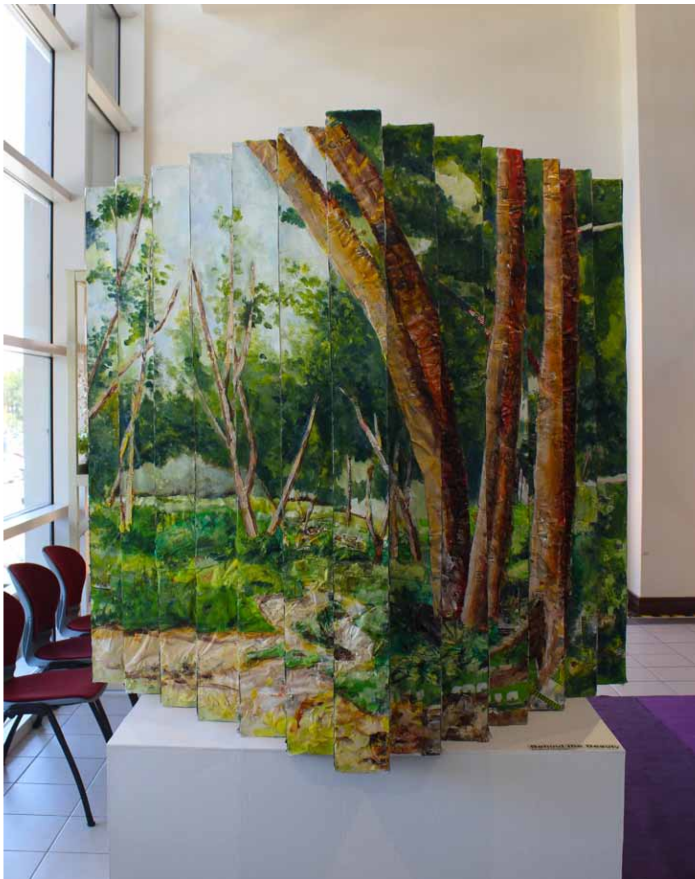
Image 11: Khairul Anwar bin Hj Ibrahim. Behind the Beauty . 2015. Acrylic & mixed media on wood panel, 48"H x 48"W x 48"D.