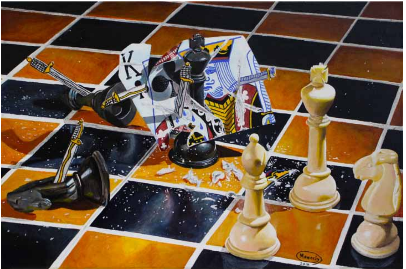
Image 14: Muhd Mawardi bin Murasedi. Given Object Painting . 2015. Acrylic on canvas, 18"H x 24"W.