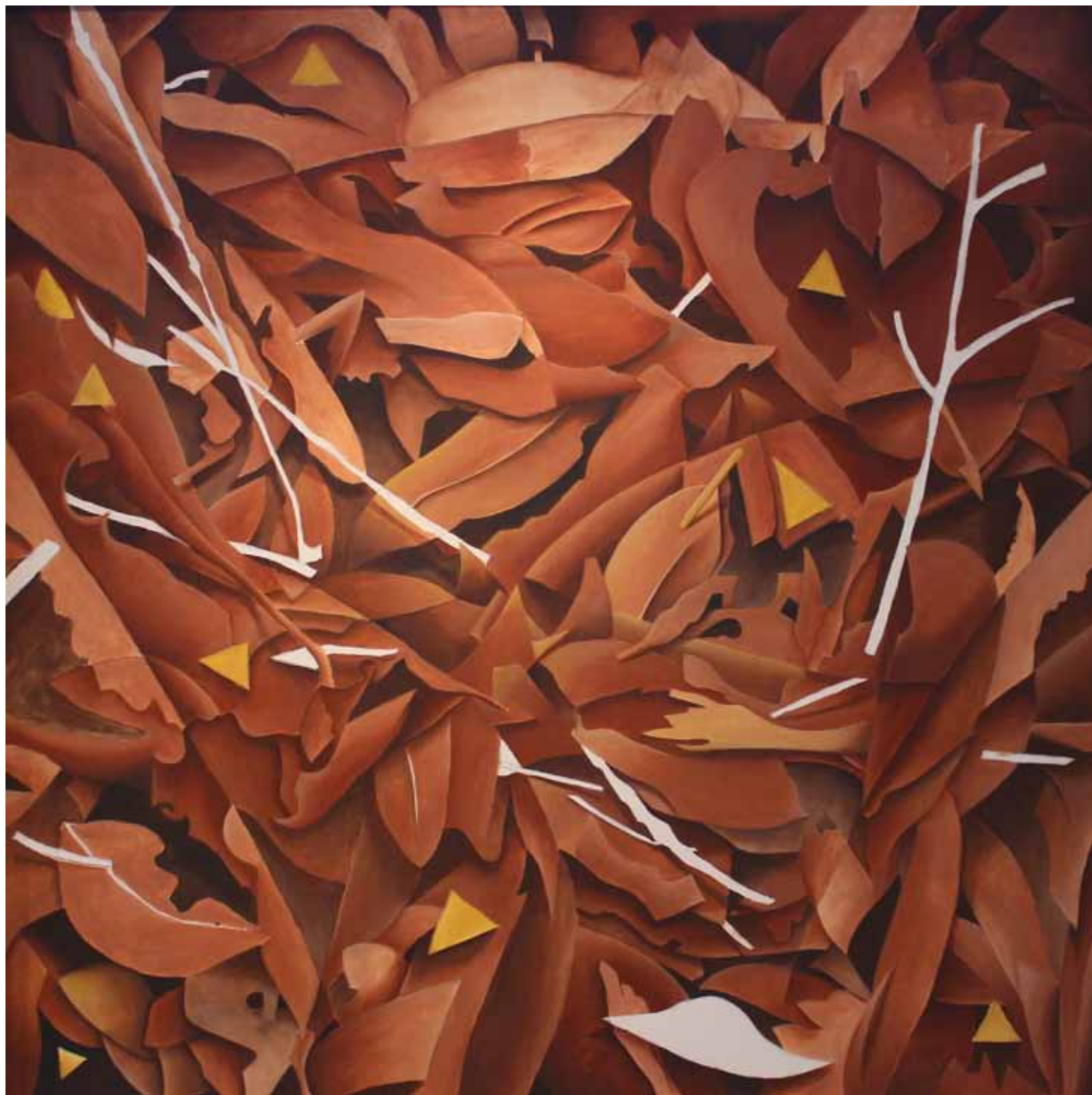
Image 9: Muhammad NiqMatul Ghizalif bin Md Jinin. Unseen Beauty . 2013. Acrylic on canvas, 40"H x 40"W.