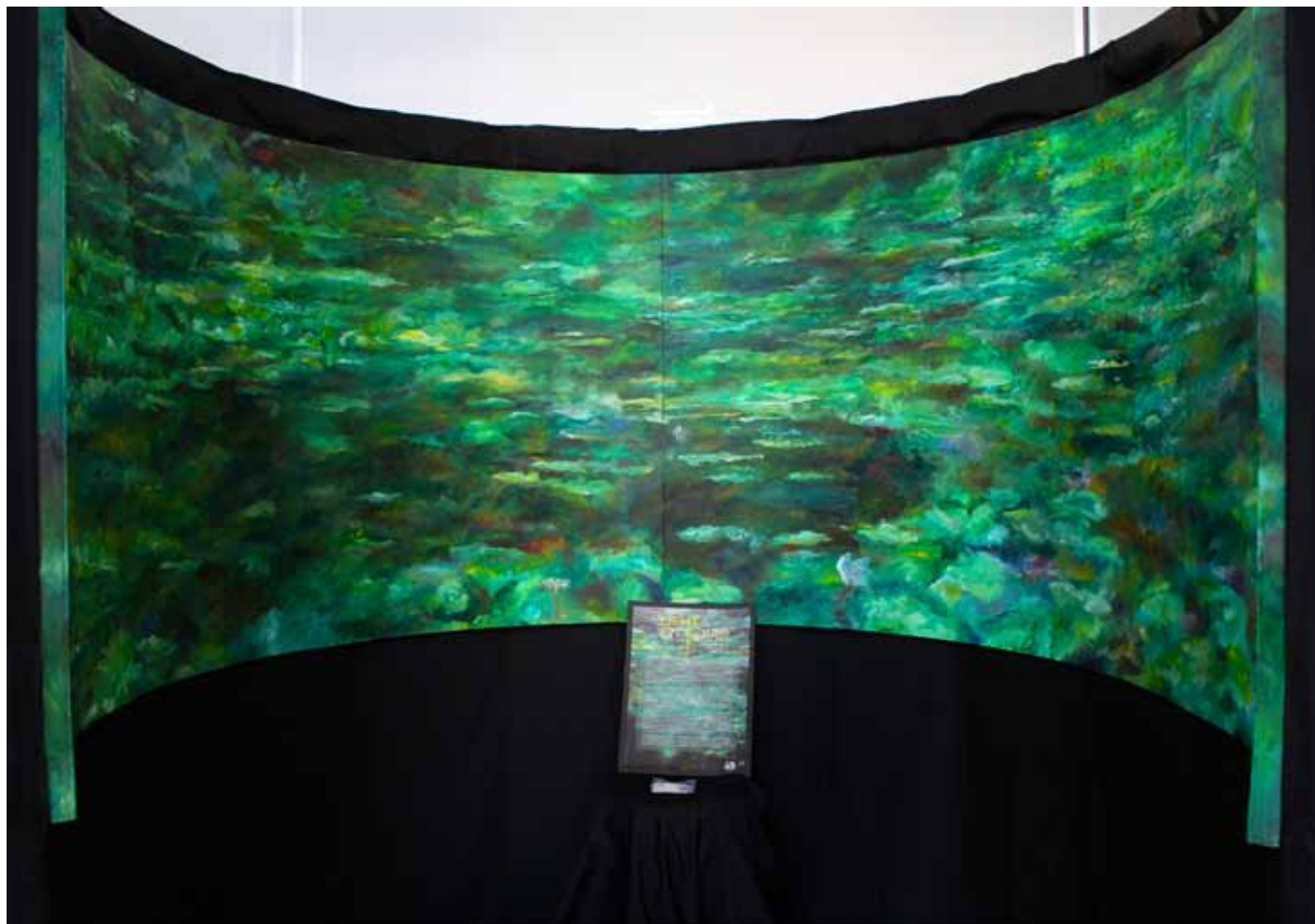
Image 8: Mohammad Izam Hj Ahmad. Within a Field of Light & Color . 2015. Acrylic on curve canvas, 40"H x 72"W.