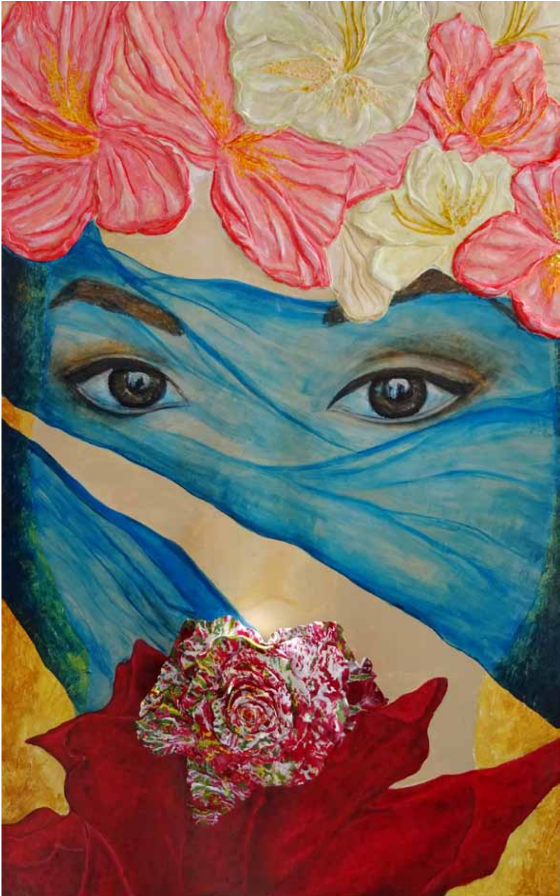
Image 2: Nur Amnani Hj Awg Md Taib. Separative-Self 1 . 2015. Acrylic on wood panel with 3D relief, 60"H x 36"W.